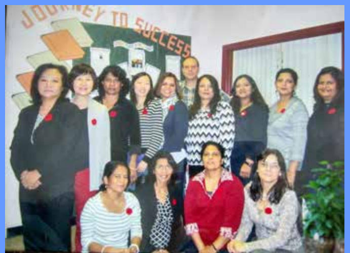
SAFSS Management 2018