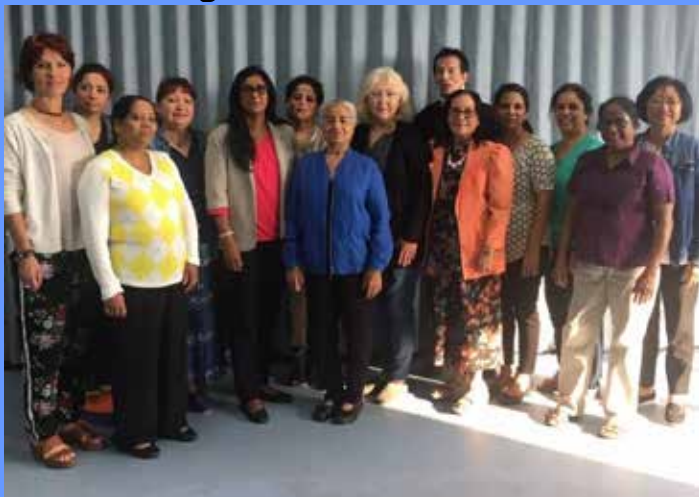
Kingston LINC Ctr. 2018