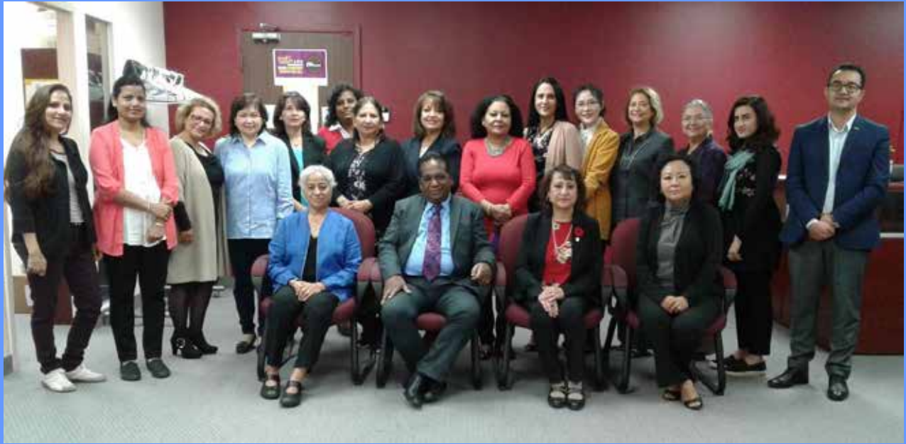
Morningside LINC Ctr. 2018