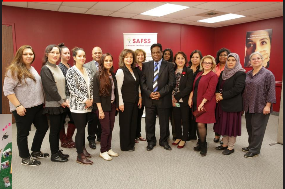
SAFSS Staff 2017