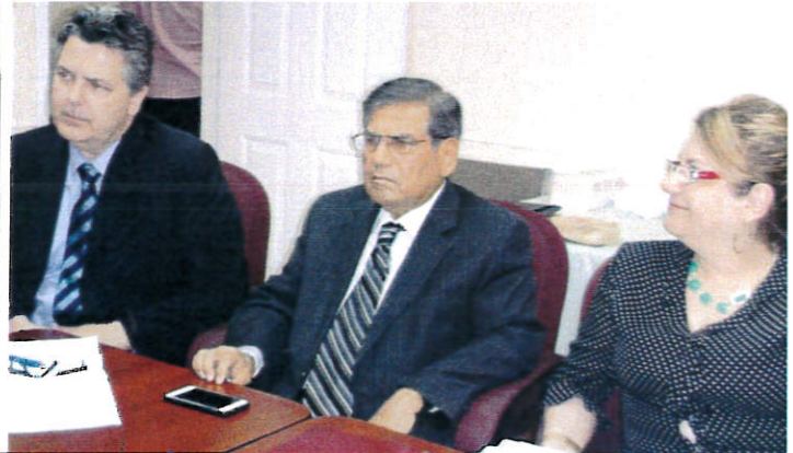
SAFSS Staff with Board and Executive Director ↕